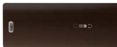
Dark Brown - RAL 8019.