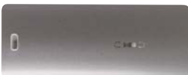
Storm Pearl - HOR 7043.