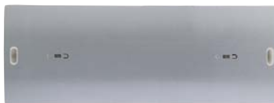
6" (150 mm) slat.