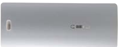
Silver Pearl - RAL 9007.