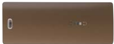
Bronze - HOR 7140.