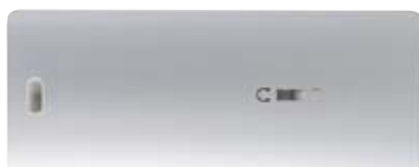
Light Silver - RAL 9006.