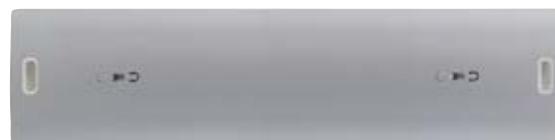
4" (100 mm) slat.