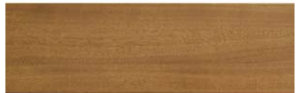
5 3/8" (137 mm) slat.