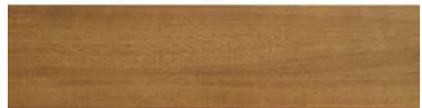
4 3/8" (112 mm) slat.